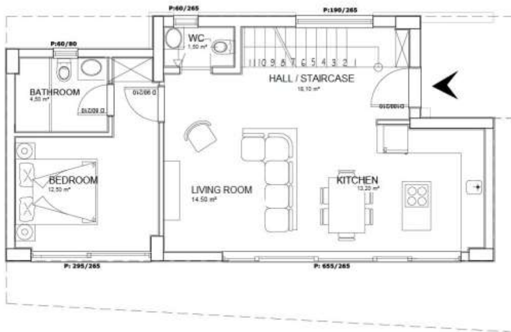
GROUND FLOOR PLAN 64,30 M 2